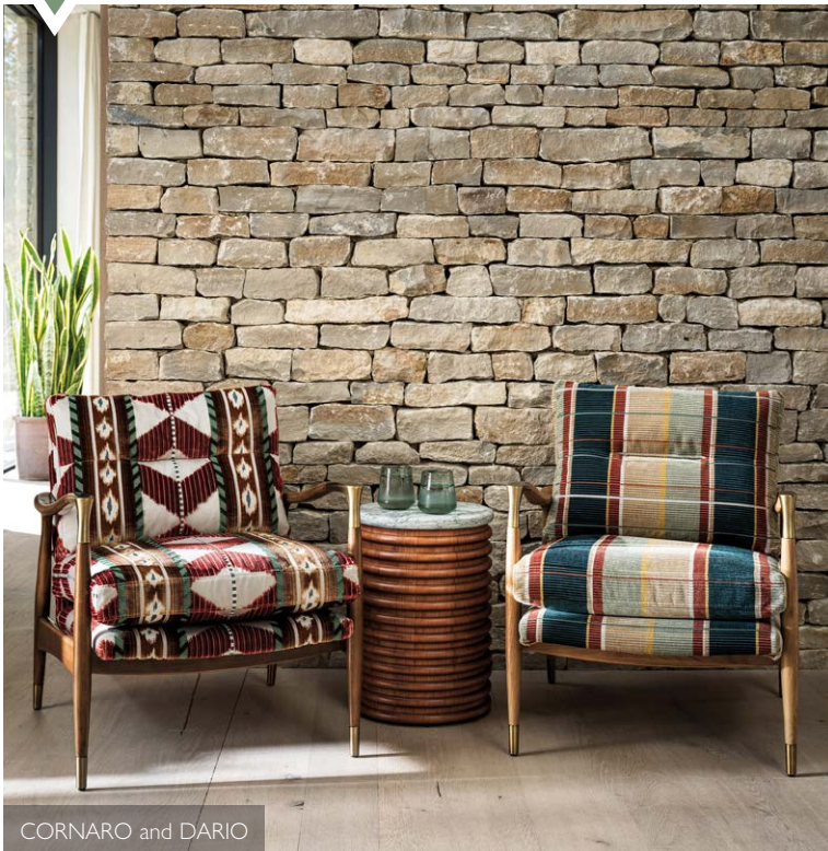
CORNARO and DARIO

Inspired by the grandeur of Venetian palazzos, the SERENISSIMA collection features luxurious velvets with vibrant stripes and bold geometric patterns. Using cut and uncut velvet techniques, these designs offer a dynamic mix of texture and visual depth, combining clean lines with the elegance of velvet to create a modern yet opulent aesthetic.